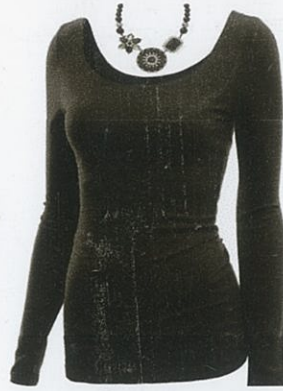
Scoop ~ Short pendant with volume