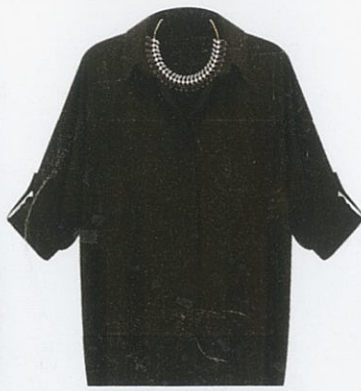
Collar ~ Short pendant or choker