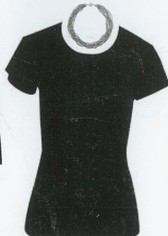
Crew ~ Bib or collar