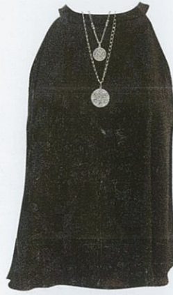
Halter ~ Slim pendant