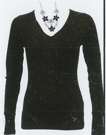
V-neck ~ V-shaped pendant