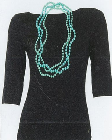
Boat ~ Long strand of beads