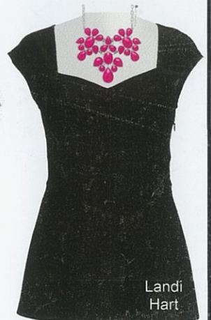
Sweetheart ~ Carved beads or pendants