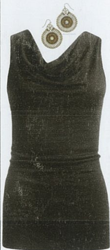
Cowl ~ Statement earrings