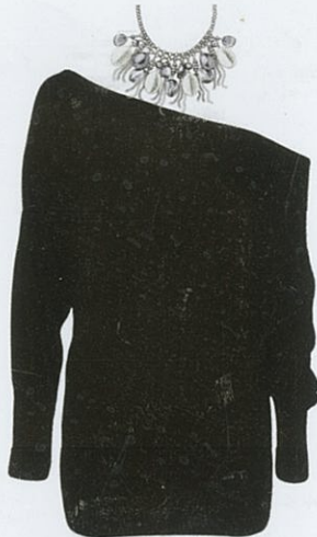
Off-shoulder ~ Asymmetric